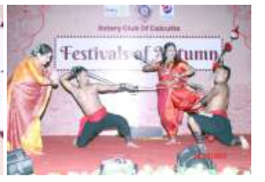
Contd. to Page 3